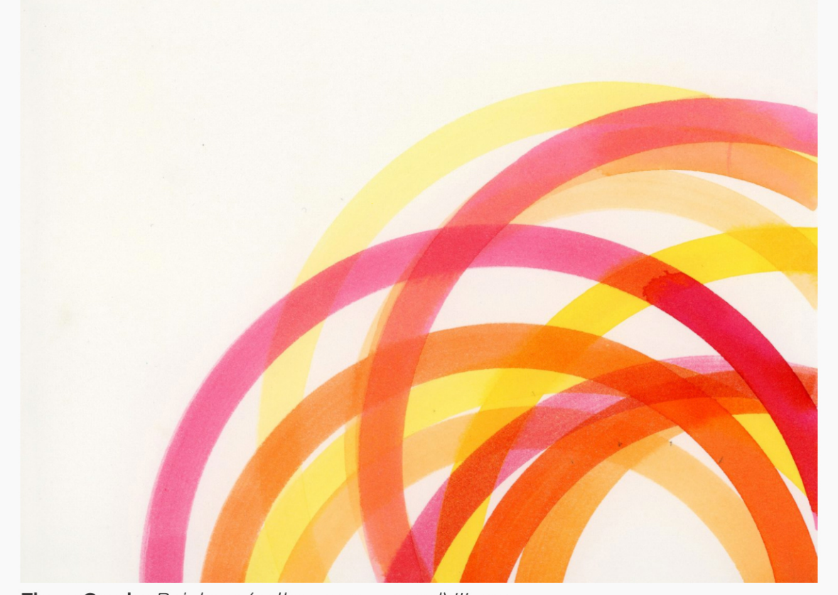
Fiona Grady: Rainbow (yellow, orange, red) III, 2020

generated to date. Works are offered for up to £200, and when an artist sells £1,000-worth they pledge to spend £200 supporting another artist. I gave myself a budget of that same £1,000 as a way to support artists whose works I like, and in several cases the covid-appropriate charitable causes towards which they in turn are donating some of their receipts. The set also acts a commemoration of these strange and alarming times.