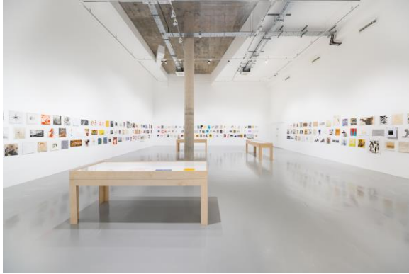
Installation views of Drawing Biennial 2026 , Drawing Room, London.