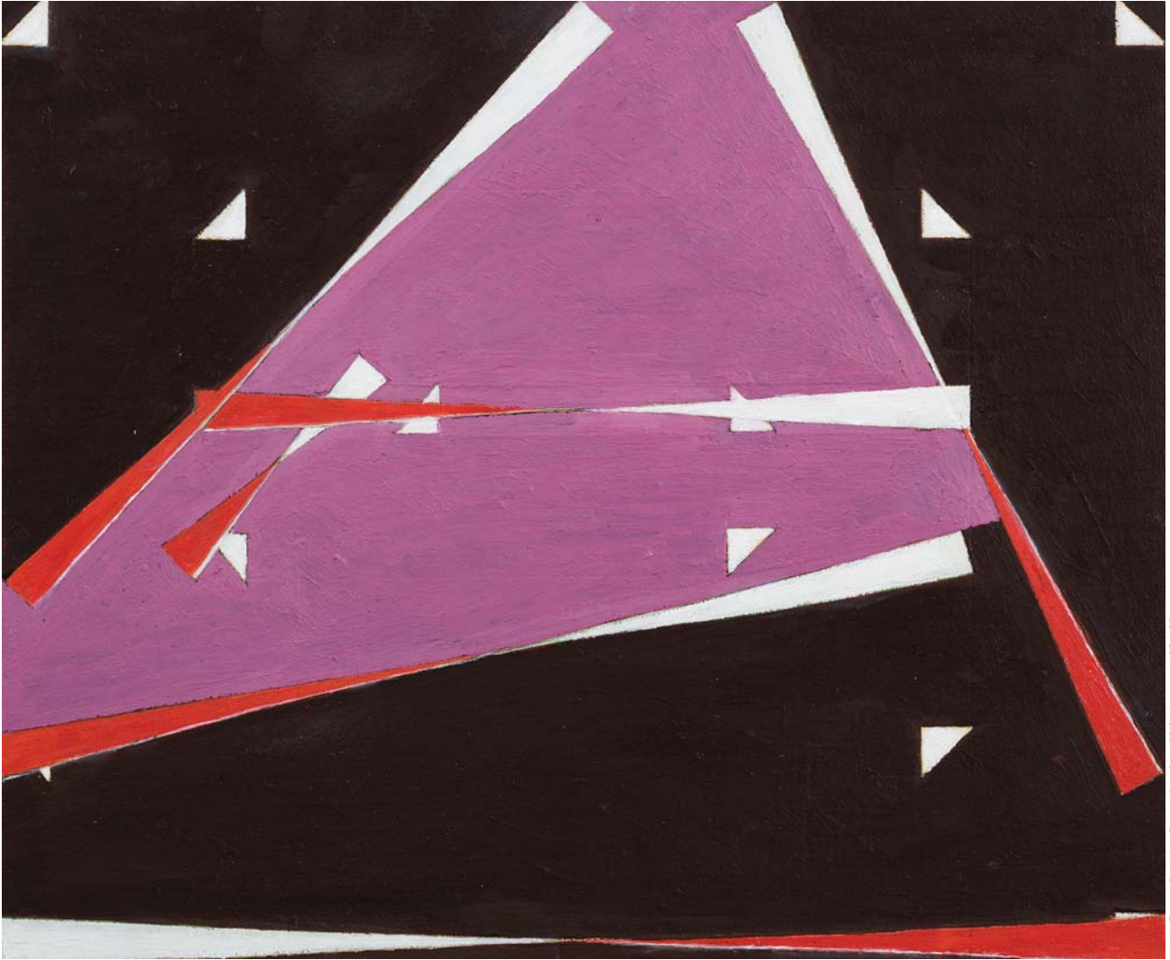
Natalie Dower: Red/White Tapered Bars Spiral 2019 oil on wood 25 x 35cm